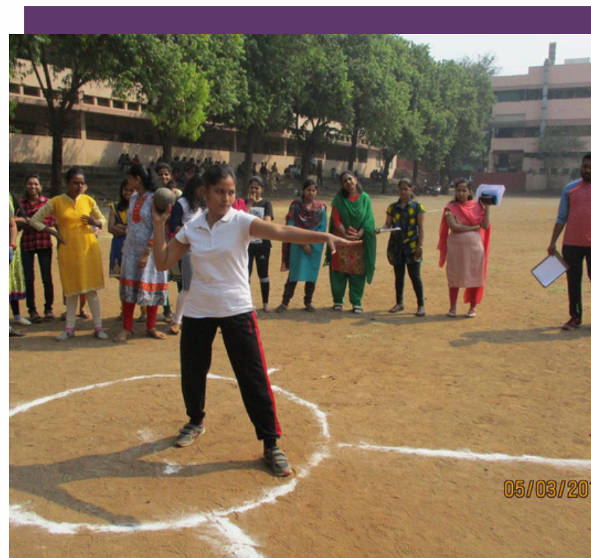
✦ SHOT PUT